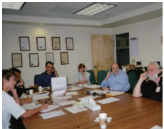
Drill participants work the phones.